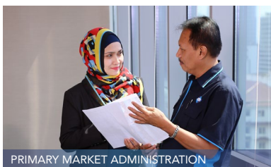
PRIMARY MARKET ADMINISTRATION

As a Securities Administration Bureau, PT. BSR Indonesia offers implementation services for primary market administration, secondary market administration, and corporate actions. PT. BSR Indonesia has obtained a business license based on the Decree of the Minister of Finance of the Republic of Indonesia No. 921/KMK.010/1990 on the granting of a business license as a Securities Administration Bureau.