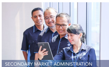
SECONDARY MARKET ADMINISTRATION