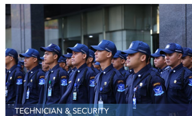
TECHNICIAN & SECURITY